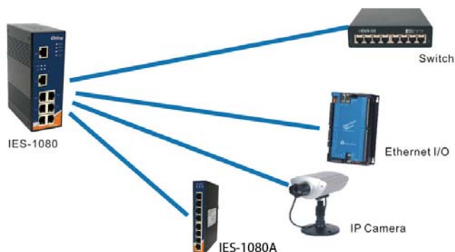
Connections of Ethernet devices

IES-1080/1062 series can be used in connecting several Ethernet devices like Ethernet I/O, IP-Camera or other Ethernet switches. In addition, there are three different power inputs to enhance its reliability, two supplied by terminal block, and one by power jack to avoid interruption caused by power down. When the primary DC power input fails, the backup power input will take over immediately to guarantee a non-stop operation.