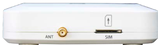
DIGI CONNECT® IT MINI LEFT