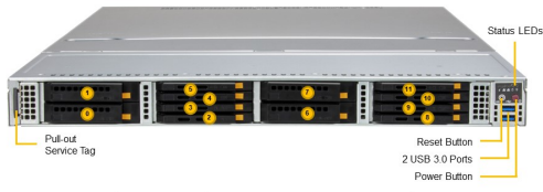
(Front View – System)